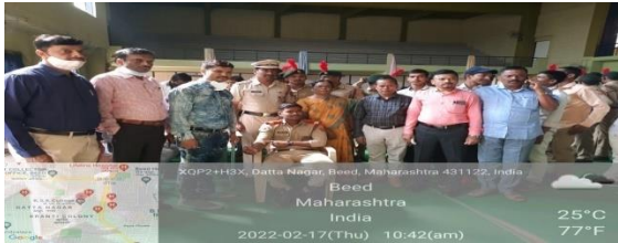
XQP2+H3X, Datta Nagar, Beed, Maharashtra 431122, India Beed Maharashtra India 25°C 77°F 2022-02-17(Thu) 10:42(am)