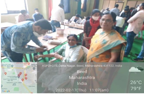
XQP2+Q78, Datta Nagar, Beed, Maharashtra 431122, India Beed Maharashtra India 26°C 79°F 2022-02-17(Thu) 11:07(am)