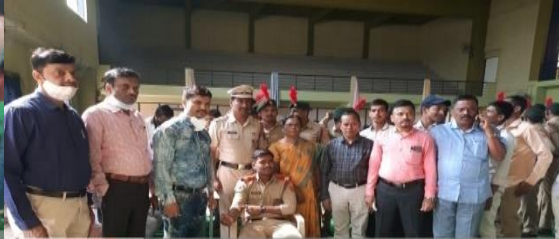
XQP2+H3X, Datta Nagar, Beed, Maharashtra 431122, India Beed Maharashtra India 25°C 77°F 2022-02-17(Thu) 10:42(am)