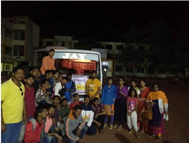
Study Tour Student participation