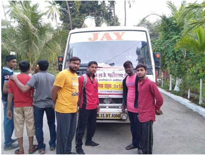
Study Tour at Alibag and Murud janjira