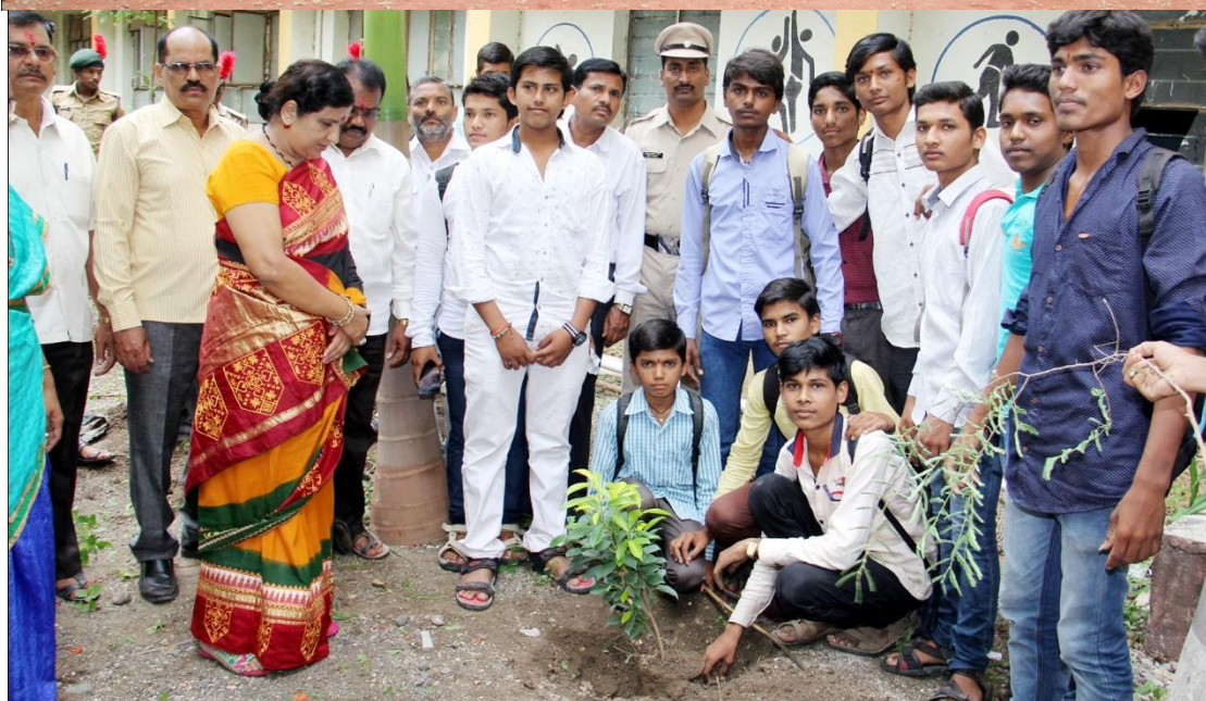
tree plantation programme organized by the College