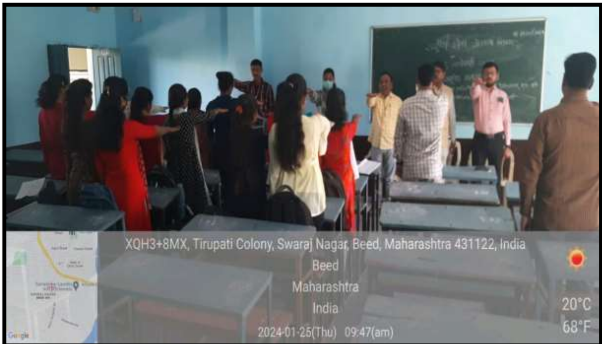
Taking Oath on the Occasion of National Voter's Day in the college